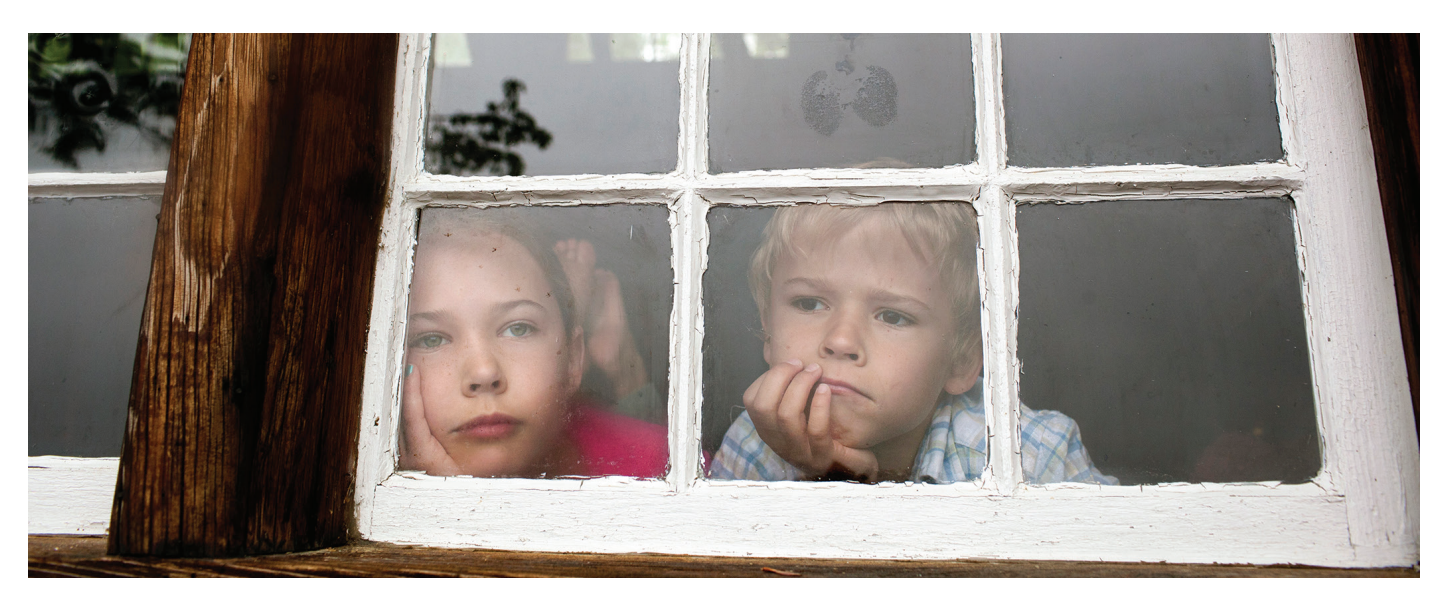
Children are at particular risk for distress, anxiety, and other adverse mental health effects in the aftermath of an extreme event.