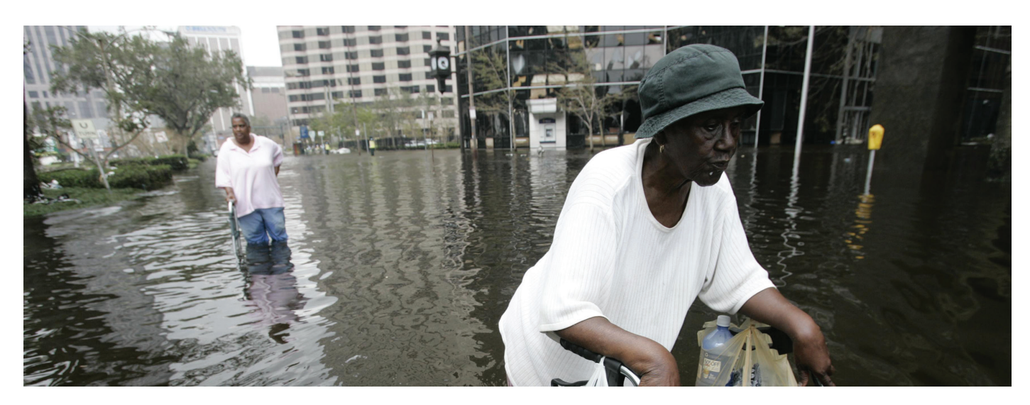
An elderly couple walk to the Superdome days after Hurricane Katrina made landfall. New Orleans, Louisiana, September 1, 2005.

increased in drought-declared Australian regions, particularly for those experiencing loss of livelihood and industry.<sup>2, 72, 74, 75,</sup> <sup>76</sup> Long-term drought has been linked to increased incidence of suicide among male farmers in Australia.<sup>2, 77</sup>