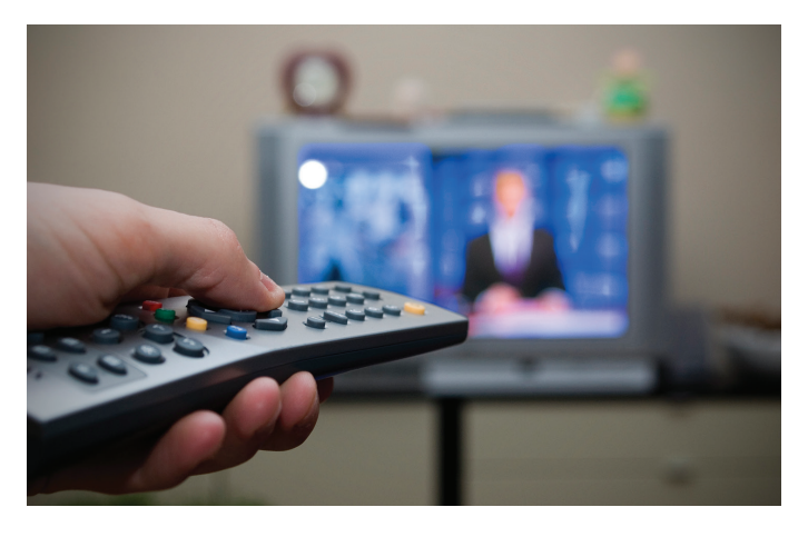
People experience the threat of climate change through frequent media coverage.

A majority of individuals psychologically affected by a traumatic event (such as a climate-related disaster) will recover over time. 120 A set of positive changes that can occur in a person as a result of coping with or experiencing a traumatic event is called post-traumatic growth. 121, 122, 123, 124 An array of intervention approaches used by mental health practitioners also may reduce the adverse consequence of traumatic events. While most people who are exposed to a traumatic event can be expected to recover over time, a significant proportion (up to 20%) of individuals directly exposed develop chronic levels of psychological dysfunction, which may not get better or be resolved. 21, 35, 47, 53, 125, 126, 127, 128 Multiple risk factors contribute to these adverse psychological effects, including disaster-related factors such as physical injury, death, or loss of a loved one; 18, 23, 51, 129 loss of resources such as possessions or property; 20, 30, 44, 46, 47 and displacement. 32, 130, 131, 132, 133, 134 Life events and stressors secondary to extreme events also affect mental health, including loss of jobs and social connections, financial worries, loss of social support, and family distress or dysfunction. 18, 20, 46, 47, 129, 135