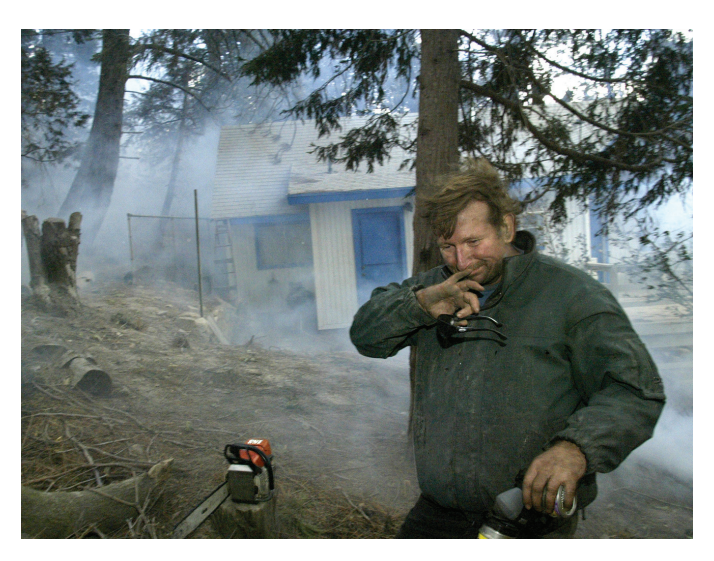
A home owner reacts after firefighters arrive to take over the protection of his home and two of his neighbors' homes in Rim Forest, California, October 3, 2003.

People living in poverty and with fewer socioeconomic resources have less capacity to adapt to the challenges brought by climate change. They are less able to evacuate should there be a natural disaster, and are more exposed to harmful conditions created by heat waves and poor air quality. Low-income people disproportionately experience the most negative impacts and weather-related mental distress due to more fragile overall health, reduced mobility, reduced access to health care, and economic limitations that reduce the ability to buy goods and services that could provide basic comfort and mitigate the effects of disasters. 140, 143