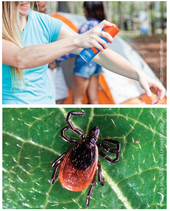
In the eastern United States, Lyme disease is transmitted to humans primarily by blacklegged (deer) ticks.

Climate change is likely to have both shortand long-term effects on vector-borne disease transmission and infection patterns, affecting both seasonal risk and broad geographic changes in disease occurrence over decades. While climate variability and climate change both alter the transmission of vector-borne diseases, they will likely interact with many other factors, including how pathogens adapt and change, the availability of hosts, changing ecosystems and land use, demographics, human behavior, and adaptive capacity. These complex interactions make it difficult to predict the effects of climate change on vector-borne diseases.