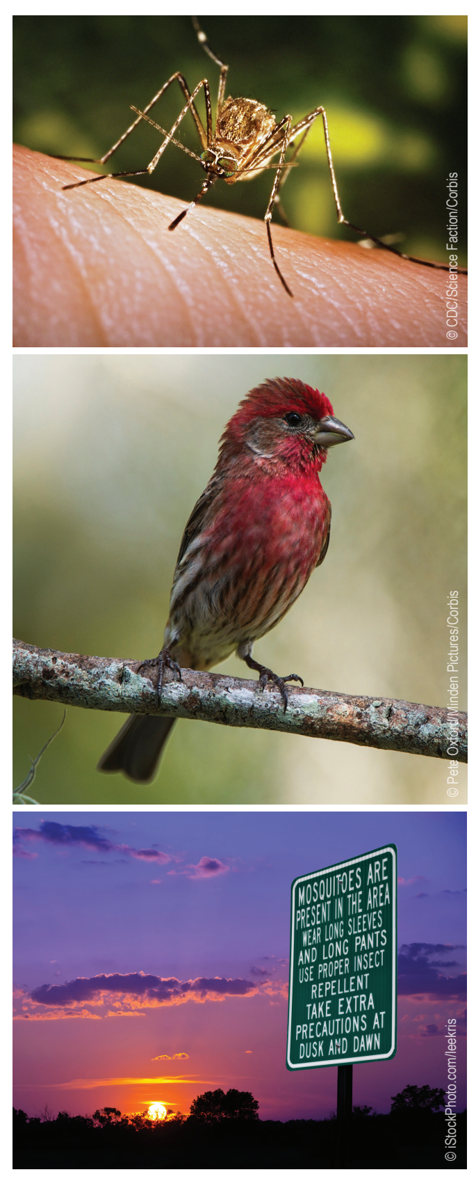
Birds such as the house finch are the natural host of West Nile virus. Humans can be infected from a bite of a mosquito that has previously bitten an infected bird.

Key Finding 4: Vector-borne pathogens are expected to emerge or reemerge due to the interactions of climate factors with many other drivers, such as changing land-use patterns [Likely, High Confidence] . The impacts to human disease, however, will be limited by the adaptive capacity of human populations, such as vector control practices or personal protective measures [Likely, High Confidence] .